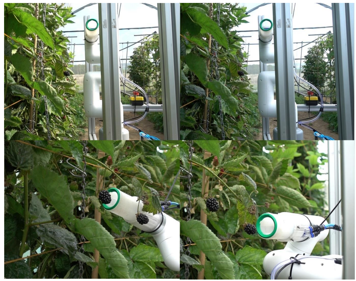
Figure 2: Top row of the image: the light variability was significant during the experiments; the two images show how the light condition changed dramatically from one moment to the next one. Below, it can be seen on two berries how the robot aligned with the wrong axis of the berry, due to the lack of a clearly elongated shape.

Dr. Calisti and Mr. Taddei Della Torre arrived at NIAB on the afternoon of July 15<sup>th</sup> and, with Dr. Whitfield, carried out a logistical inspection of the NIAB polytunnel and planned the activities for the following days.