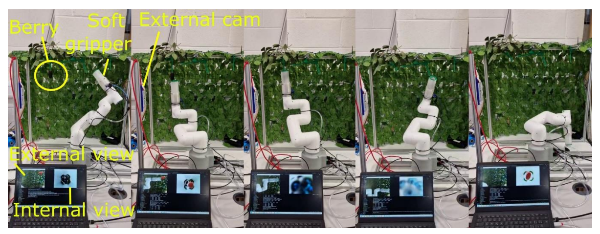
Figure 1: The robotic arm equipped with a soft gripper, controlled by an external laptop, a realsense camera, and a USB camera (inside the gripper). The picture shows the views from the external and internal cameras (for user feedback on the laptop), while the arm moves autonomously toward the plastic berry, aligns to the main axis of the fruit, and ingests it within the gripper. The gripper then inflates and detaches the berry, and eventually it collects it on the table.

A blackberry soft gripper [1], developed within the context of a Collaborative Training Partnership (CTP) for Fruit Crop Research, supported in part by Berry Gardens Ltd. and in collaboration with NIAB, has been integrated into a small robotic arm equipped with an external RGB-D camera and an internal camera to achieve autonomous harvesting. This work, carried out in collaboration with the University of Trento (UoT) within the context of an Erasmus+ visiting student agreement between UoT and the University of Lincoln (UoL), demonstrated excellent results in a lab setting with physically replicated blackberries.